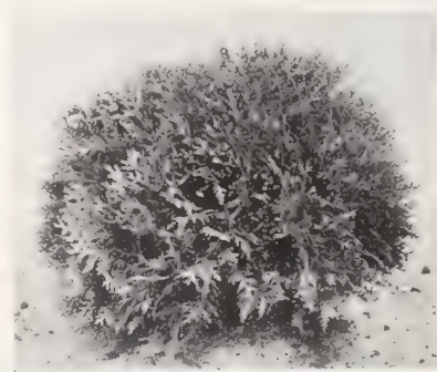
GLOBE ARBOR VITAE

ANDORRA JUNIPER. J. depressa plumosa . A more prostrate and softer form of Spreading Juniper. The foliage turns purple in autumn. 15 to 18 in. $2.50 each; 18 to 24 in. $3.50 each; 2 to 3 ft. $4.50 each.